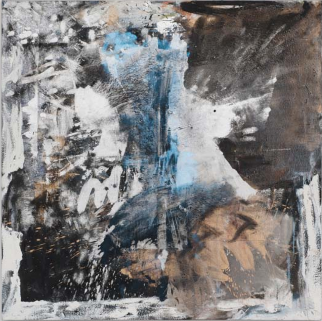
Untitled 2013 oil, metallic oil, iridescent oil on canvas 48x48x1.5