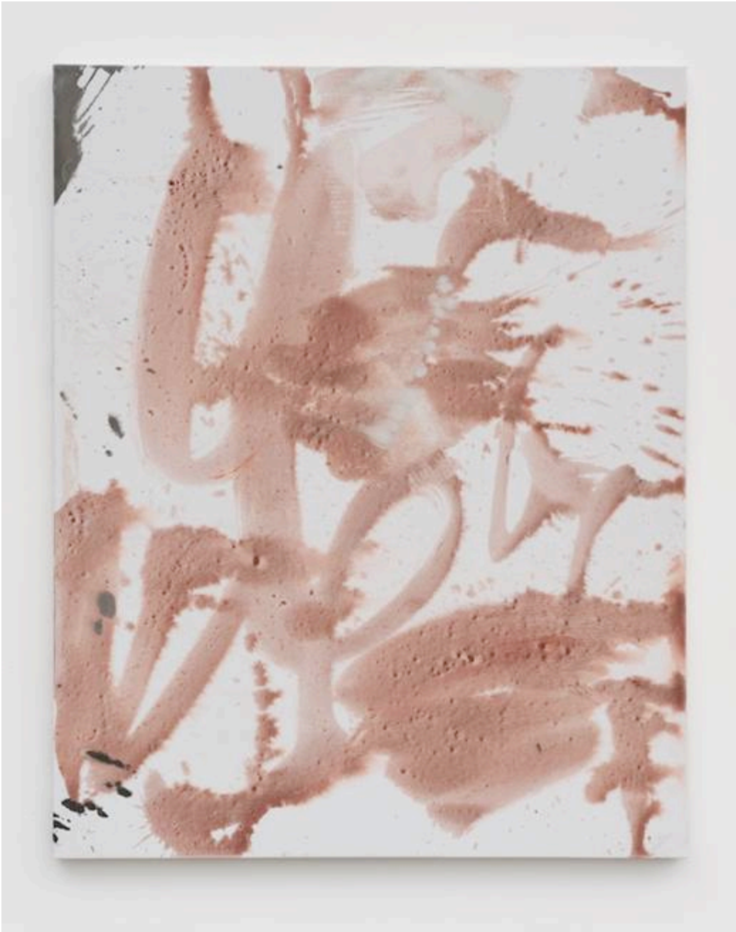
Untitled, 2013 oil, iridescent oil and metallic oil on polyester 30x24x0.75 in