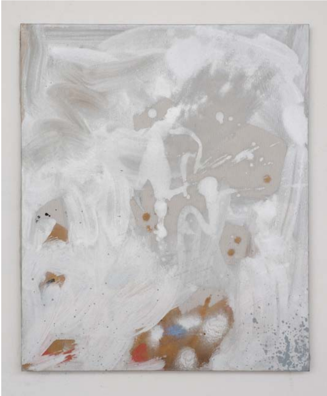
Untitled 2013 Oil, metallic oil and iridescent oil on polyester. 22x18x0.75 in