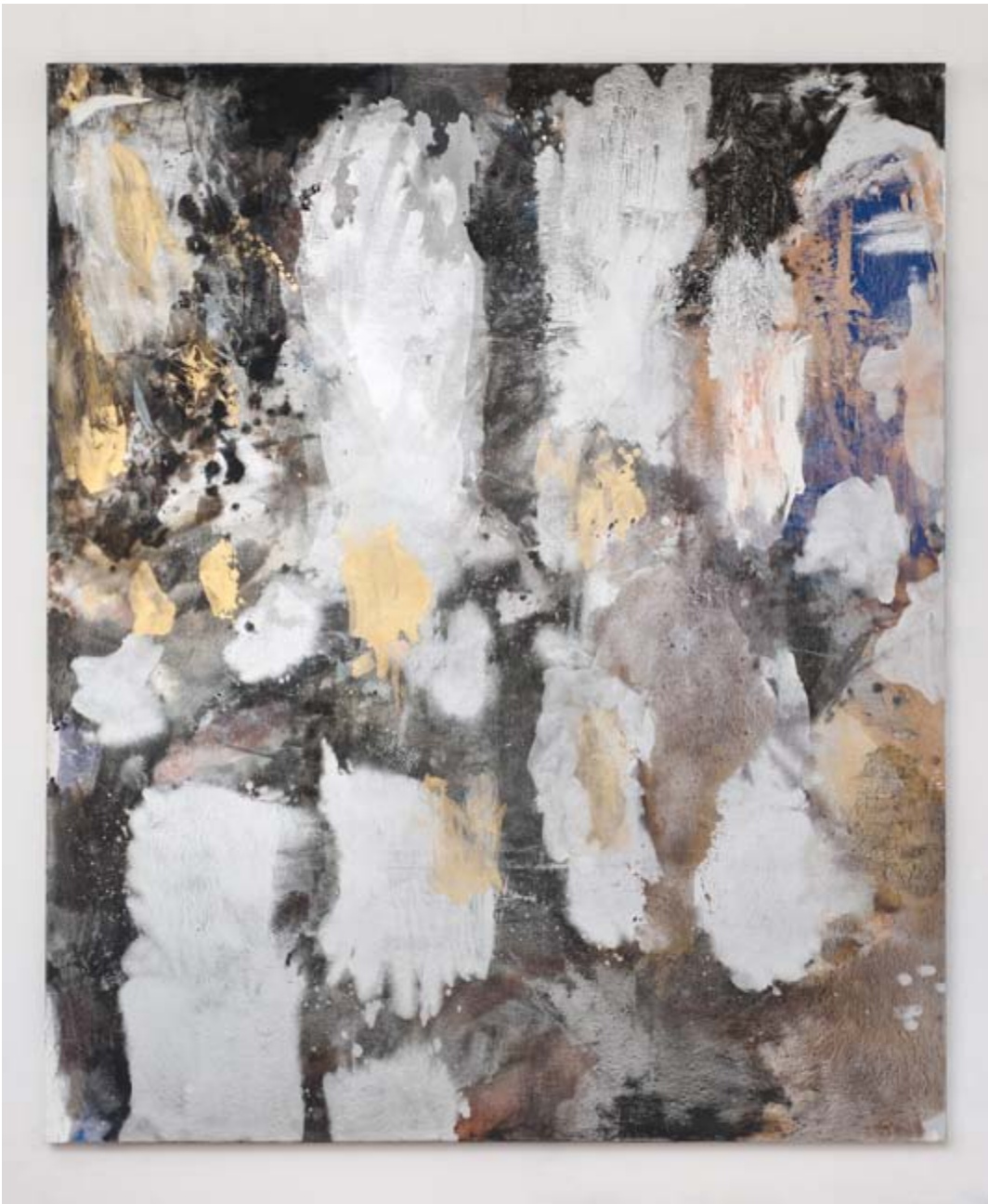
Untitled 2013 Oil, metallic oil, iridescent oil on canvas 78x72x1.5 in