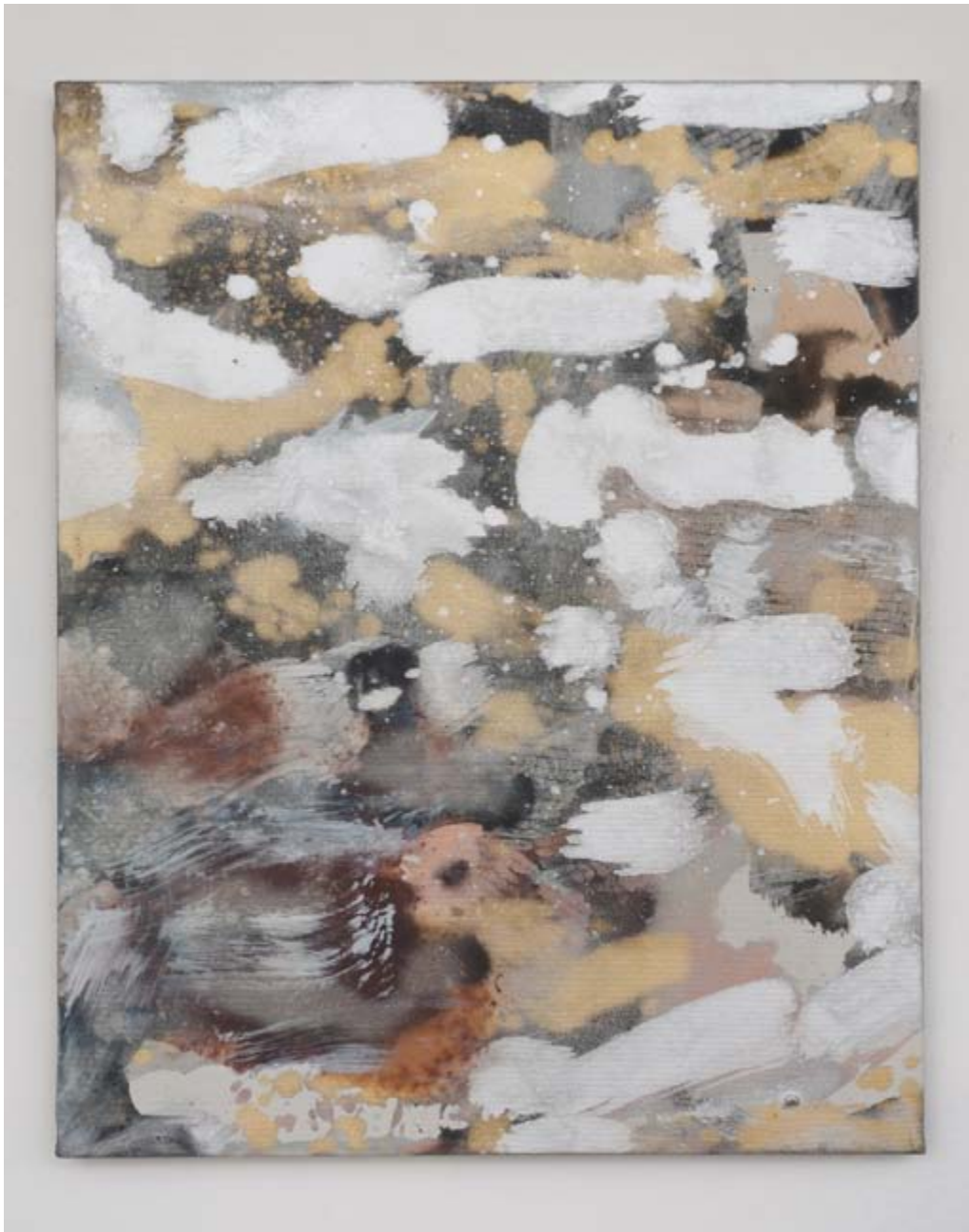
Untitled 2013 Oil, metallic oil and iridescent oil on polyester 20x16x0.75 in